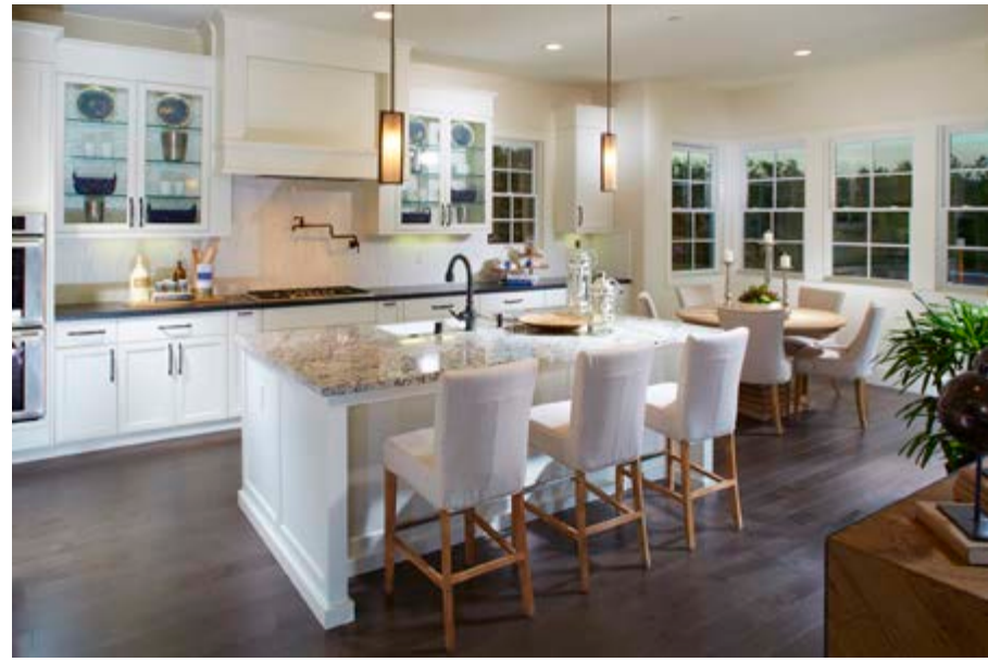
Harvest Court's kitchens are built for entertaining. At right, the grand staircase. Photos Provided Additionally, each home's garage – some for two cars and some for three – is wired for an electric plug-in car. There are numerous optional features, including a solar energy package and home monitoring system.

Adjacent to the Harvest Court development will be a two-plus acre passive park, with native plantings, two bridges and benches for sitting and relaxing. A meandering trail will lead from the homes to the popular Moraga Commons and skatepark. A landscaped outlook area, with benches and covered trellis, is also planned, where residents and non-residents can simply sit and take in the area's natural beauty.